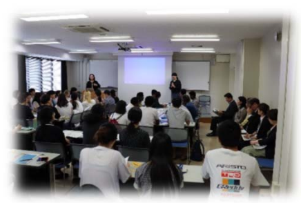
December: Annual Party for International Students