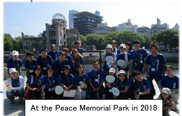
At the Peace Memorial Park in 2018 (11 countries · 19 Participants)