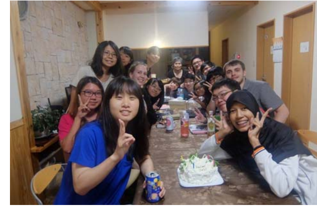
Dinning & Living