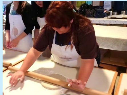
Making Japanese Soba noodle