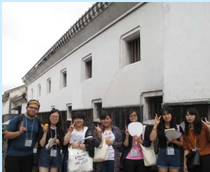
City attraction tour

1 Weekend: Homestay (three-day and two-night)