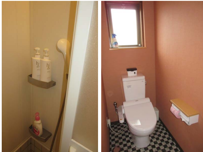
Shower & Toilet