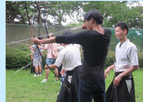
Japanese traditional sports