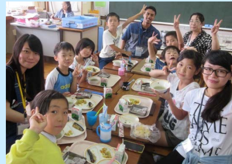
Interaction with elementary school students