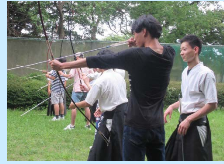
Japanese traditional sports