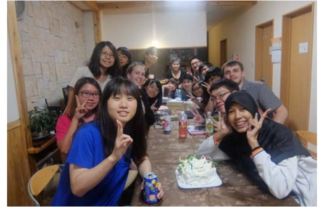
Dinning & Living