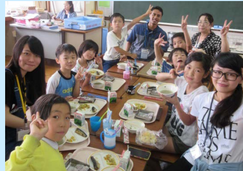
Interaction with elementary school students