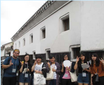
City attraction tour

1 Weekend: Homestay (three-day and two-night)