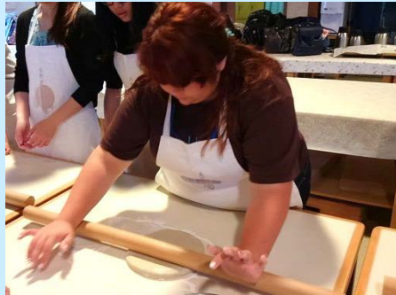
Making Japanese Soba noodle